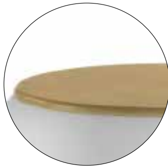
DETTAGLIO / DETAIL