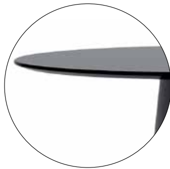
DETTAGLIO / DETAIL